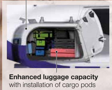
Enhanced luggage capacity with installation of cargo pods