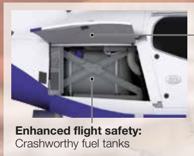
Enhanced flight safety: Crashworthy fuel tanks